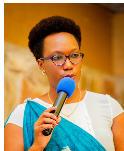
Mme Marie Chantal NIJIMBERE Minister of Trade, Transport, Industry and Tourism

Administration (Mount Kenya University), Mrs. Marie Chantal Nijimbere is also a member of the Professional Organization of Accountants of Burundi (OPC). Since 2020, she has held ministerial responsibilities in the Government of Burundi, first as Minister of Communication, Information Technology and Media, and then, since 2021, as Minister of Trade, Transport, Industry and Tourism, where she plays a key role in the socio-economic development of the country.