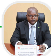
Ir Alain Tribert MUTABAZI

Ministre de l'Intérieur, du Développement Communautaire et de la Sécurité Publique