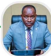
Mr Audace NIYONZIMA

Ministre des Affaires Etrangères et de la Coopération au Développement