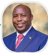
S.E Evariste NDAYISHIMIYE