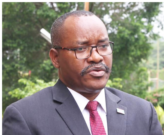
M. Audace NIYONZIMA, Minister of Finance, Budget and Economic Planning

Since 2022, he has served as Minister of Finance, Budget and Economic Planning, where he leads the country's economic transformation efforts with leadership focused on transparency, efficiency and the modernization of economic institutions.